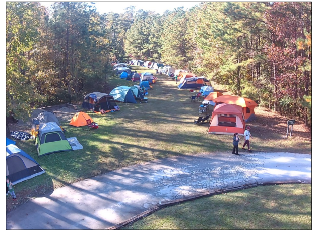
Pack 132 Scouts set up on the Birdsong Parade Ground

New volunteers are always welcome. We work Tuesday and Thursday mornings from approximately 7:00 to 10:00 a.m. and invite anyone interested in helping preserve this historic site to join us.