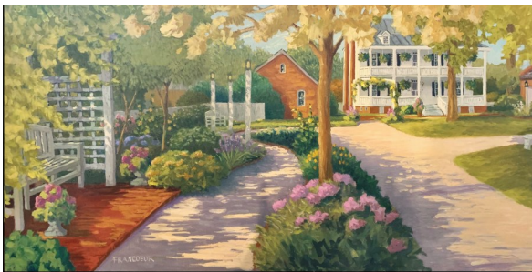
Beautiful Attmore-Oliver House view

The summer heat is here, which means it's the time when our staff puts the final touches on the plans for the upcoming year of programs. I am very pleased to report that we have an action-packed schedule lined up for August through June 2026. Be sure to follow our events calendar every newsletter as well as on our website to ensure you get the first opportunity for ticket sales and any information updates. We always welcome your phone calls or visits to the office if we can further assist you in any way. The Attmore-Oliver House is your home for history !