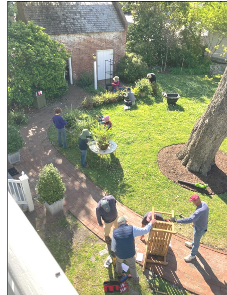
Another busy day on campus!

To express your interest in volunteering or to learn more about how you can support the New Bern Historical Society, please contact our office directly. We welcome your enthusiasm and willingness to contribute to our mission. Thank you for considering to be a part of this great adventure!