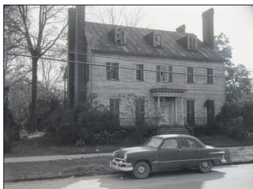
Attmore-Oliver House prior to restoration in 1954