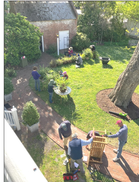
Another busy day on campus!

To express your interest in volunteering or to learn more about how you can support the New Bern Historical Society, please contact our office directly. We welcome your enthusiasm and willingness to contribute to our mission. Thank you for considering to be a part of this great adventure!