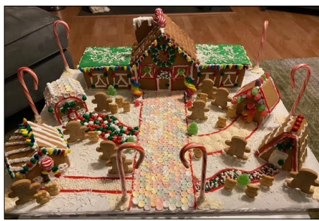
People's Choice — Delightful Village by Nicole Allen, North Chesterfield VA