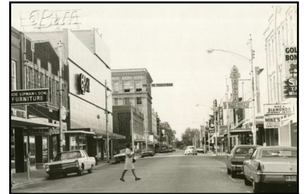
200 block of Middle Street View North