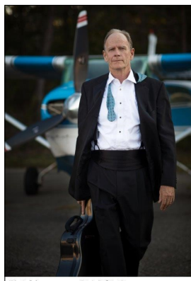
Livingston Taylor

Now celebrating 50 years of performing, Livingston has a musical knowledge and repertoire including writing songs recorded by brother James Taylor. He is equally at home with a range of musical genres—folk, pop, gospel, jazz—and upbeat storytelling touching ballads. Livingston Taylor was the first Historical Society concert in 2010. So this year's concert is truly a homecoming for Liv.