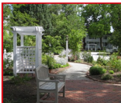
Attmore-Oliver House Historical Gardens (rear of 511 Broad Street)