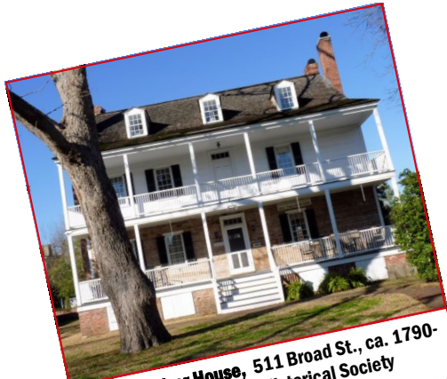
Attmore-Oliver House, 511 Broad St., ca. 1790-1800, owner: New Bern Historical Society