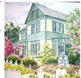
Painting by Janet Francoeur

Tickets: $15 in advance, $20 days of the tour, $13 for active duty military and dependents with ID, $13 per person for groups of 12 or more and $13 advance ticket sale for members of the Historical Society or Preservation Foundation. (continued on page 2)