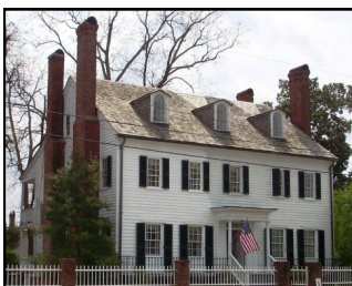
Annual Volunteer Appreciation social, Sunday, May 20 at the Attmore-Oliver House

WE ARE STILL ACCEPTING ITEMS FOR OUR ABC SALE! BRING THEM TO OUR OFFICE, 511 BROAD STREET! FOR PICK UP OF LARGER ITEMS, CONTACT OUR OFFICE, 638-8558.