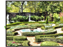
Tryon Palace Gardens 610 Pollock St., owner: NC Department of Natural and Cultural Resources