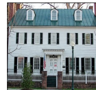
Attmore-Oliver House 511 Broad St., ca. 1790-1800 owner: New Bern Historical Society