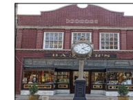
Baxters Jewelry Store 323 Pollock St., owner: Fine Art at Baxters