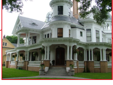
Relax and enjoy refreshments at The Blades' Veranda Café , corner of Johnson and Middle Streets! Lunch, beverages and delicious baked goods served on the porch. $6 Bag Lunches! Open 10 a.m.- 4 p.m.