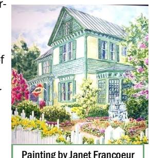
Painting by Janet Francoeur

Tickets: $15 in advance, $20 days of the tour, $13 for active duty military and dependents with ID, $13 per person for groups of 12 or more and $13 advance ticket sale for members of the Historical Society or Preservation Foundation. (continued on page 2)