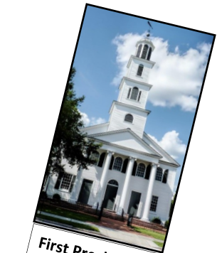
First Presbyterian Church 400 New Street