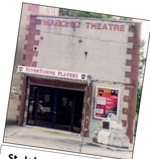
St. John Masonic Theatre 516 Hancock Street