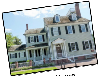
Dixon House 609 Pollock Street