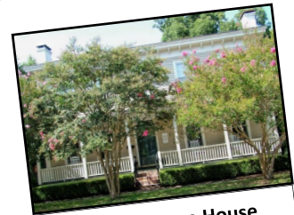
Marshall Lane House 516 Johnson Street

Title Sponsor: Chesnut, Clemmons & Peacock— Your Trial Attorneys