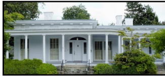
Attmore-Wadsworth House 515 Broad Street