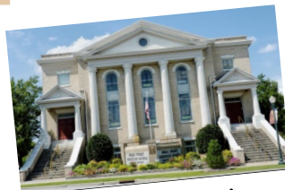
Broad Street Christian Church 802 Broad Street