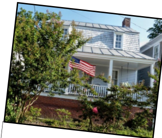
Pendleton House 815 Pollock Street