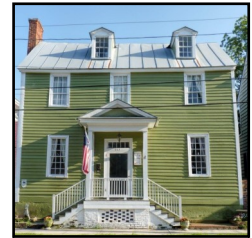
John Horner Hill House 713 Pollock Street