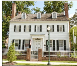
AGONY ALLEY Located Inside Attmore -Oliver House 511 Broad Street

Two tickets, at a special price of $14 each, will be mailed to our membership. We appreciate our members supporting this major fundraising event.