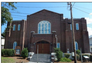
St. Peter's A.M.E. Zion Church 617 Queen Street

Ghostwalk Poster