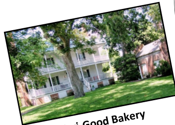
Veri-Good Bakery Located behind Attmore- Oliver House 511 Broad Street