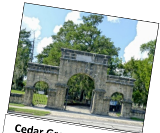
Cedar Grove Cemetery Queen Street