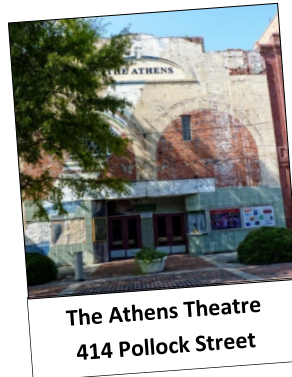
The Athens Theatre 414 Pollock Street