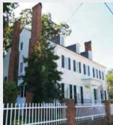
Attmore-Oliver House 511 Broad Street ca. 1790-1800 Owner: New Bern Historical Society