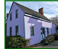
Osgood Cottage GARDEN ONLY 807 Pollock Street, owner: Pitt Tyer