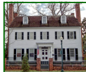
Attmore-Oliver House and historical gardens 511 Broad Street, ca. 1790-1800 owner: New Bern Historical Society