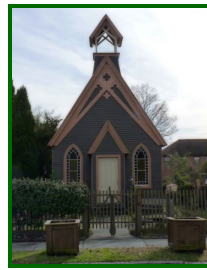
All Saints Chapel 809 Pollock Street, ca. 1895 owners: Cate and Ross Pfeiffer