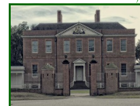
Tryon Palace GARDENS ONLY 610 Pollock Street Owner: NC Dept. Cultural Resources